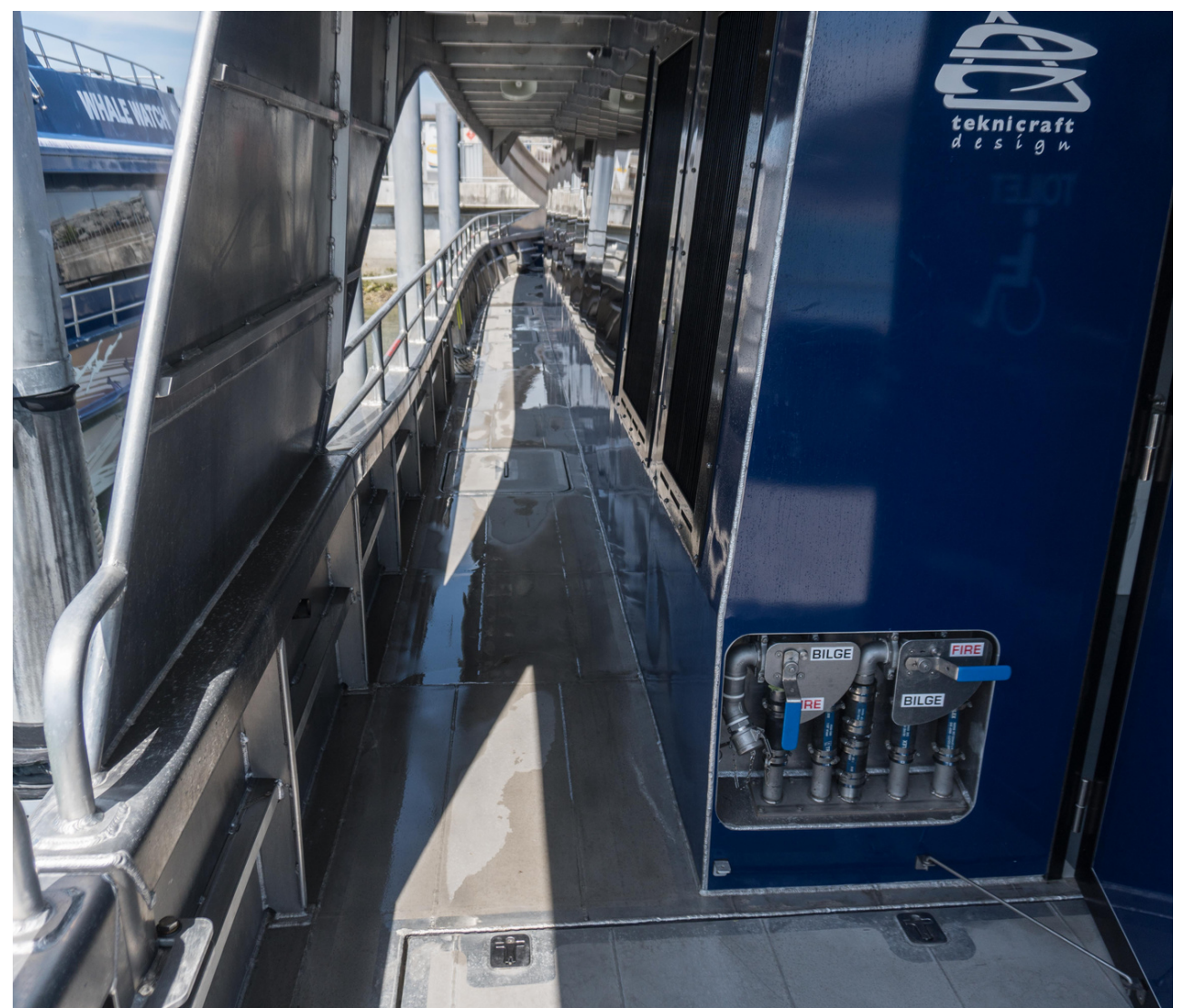
Wide with room to wheel through