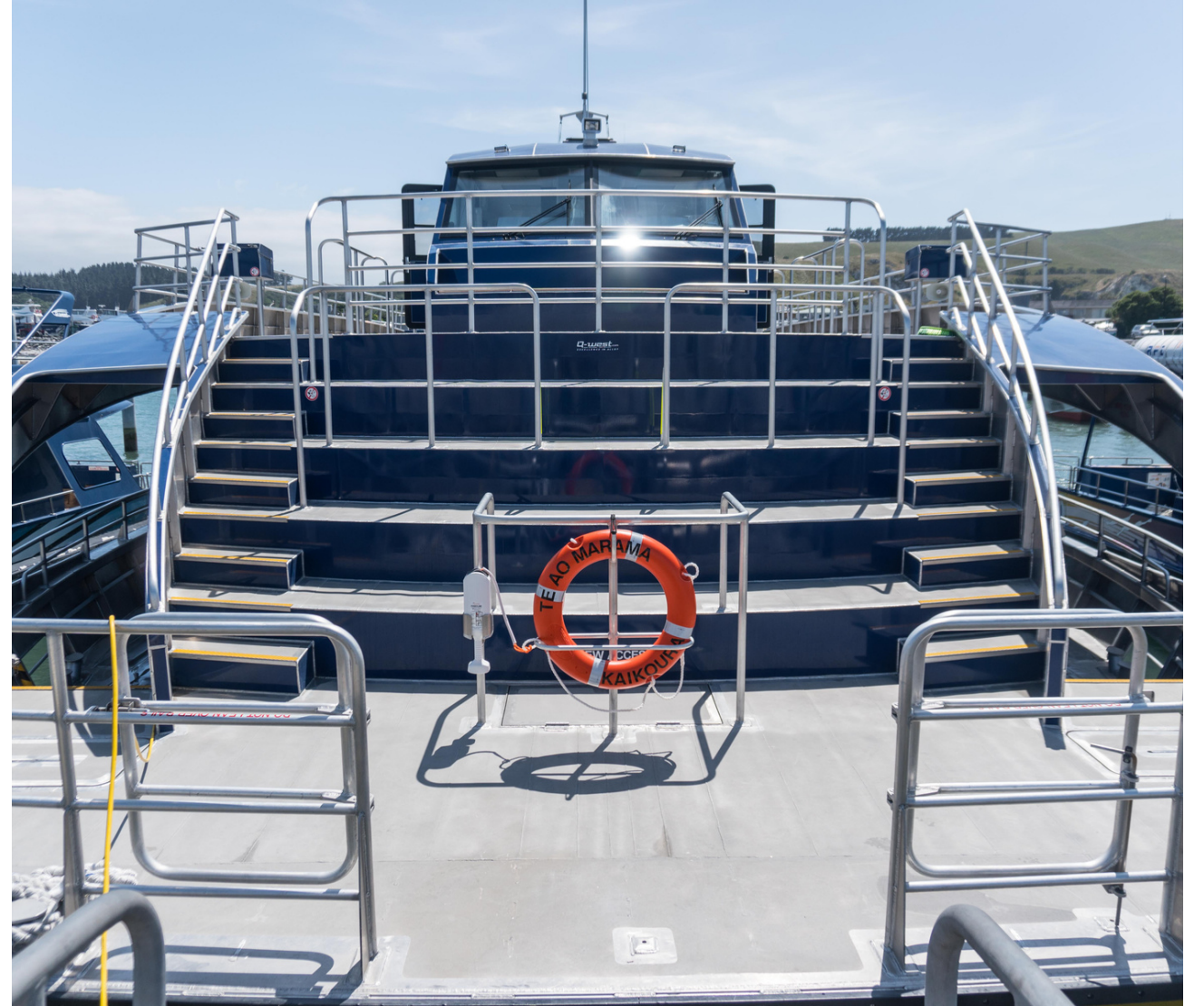
Front Deck - The Bow