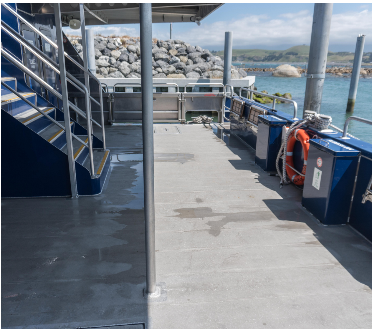
Back Deck - The Stern