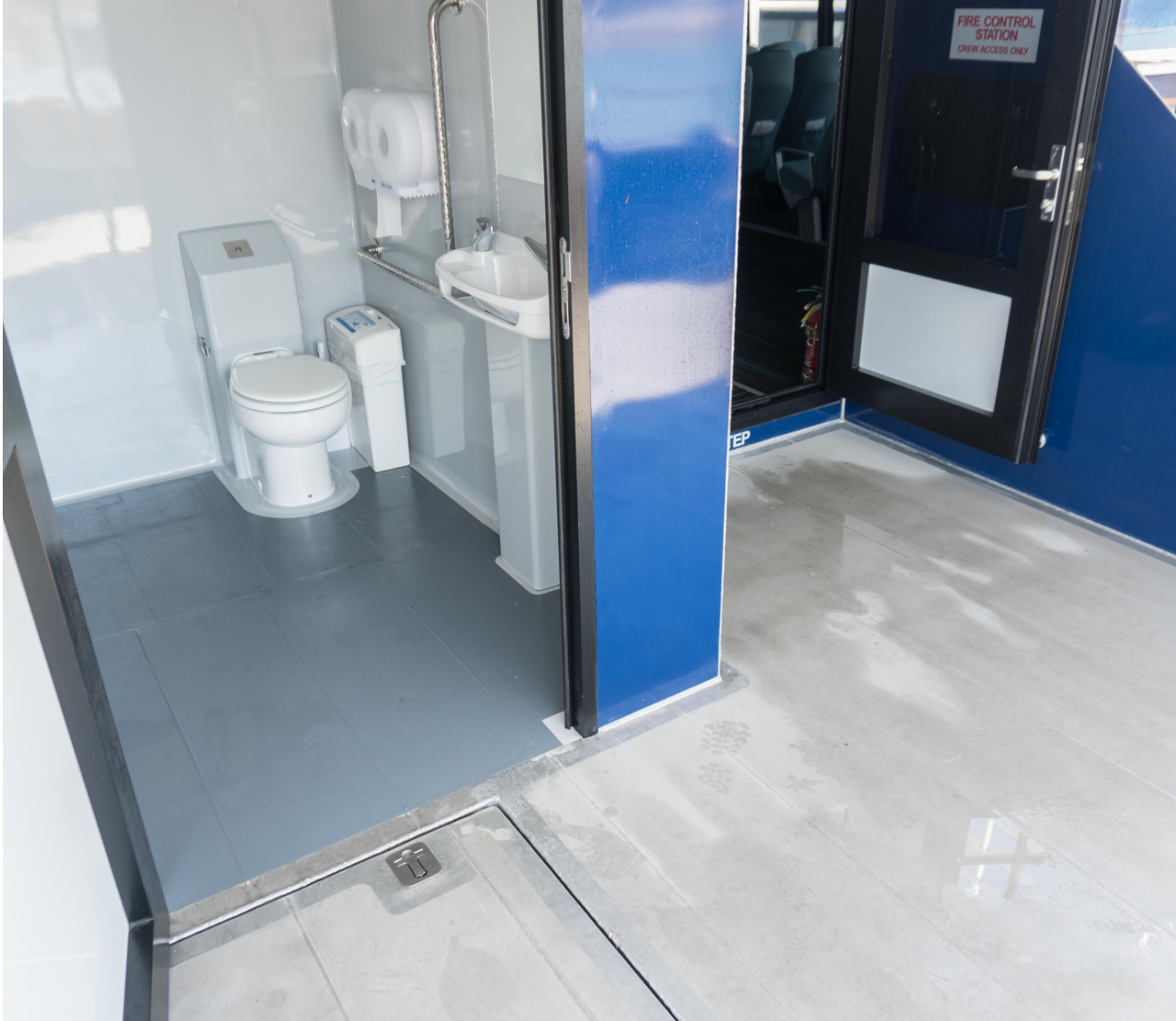
Wheelchair Access Bathroom