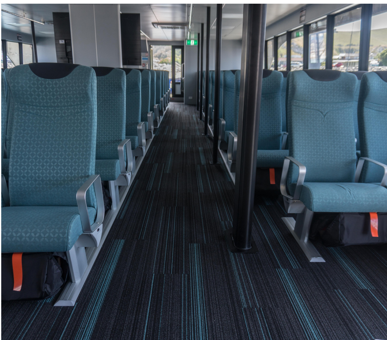
Wide aisle with room to wheel through